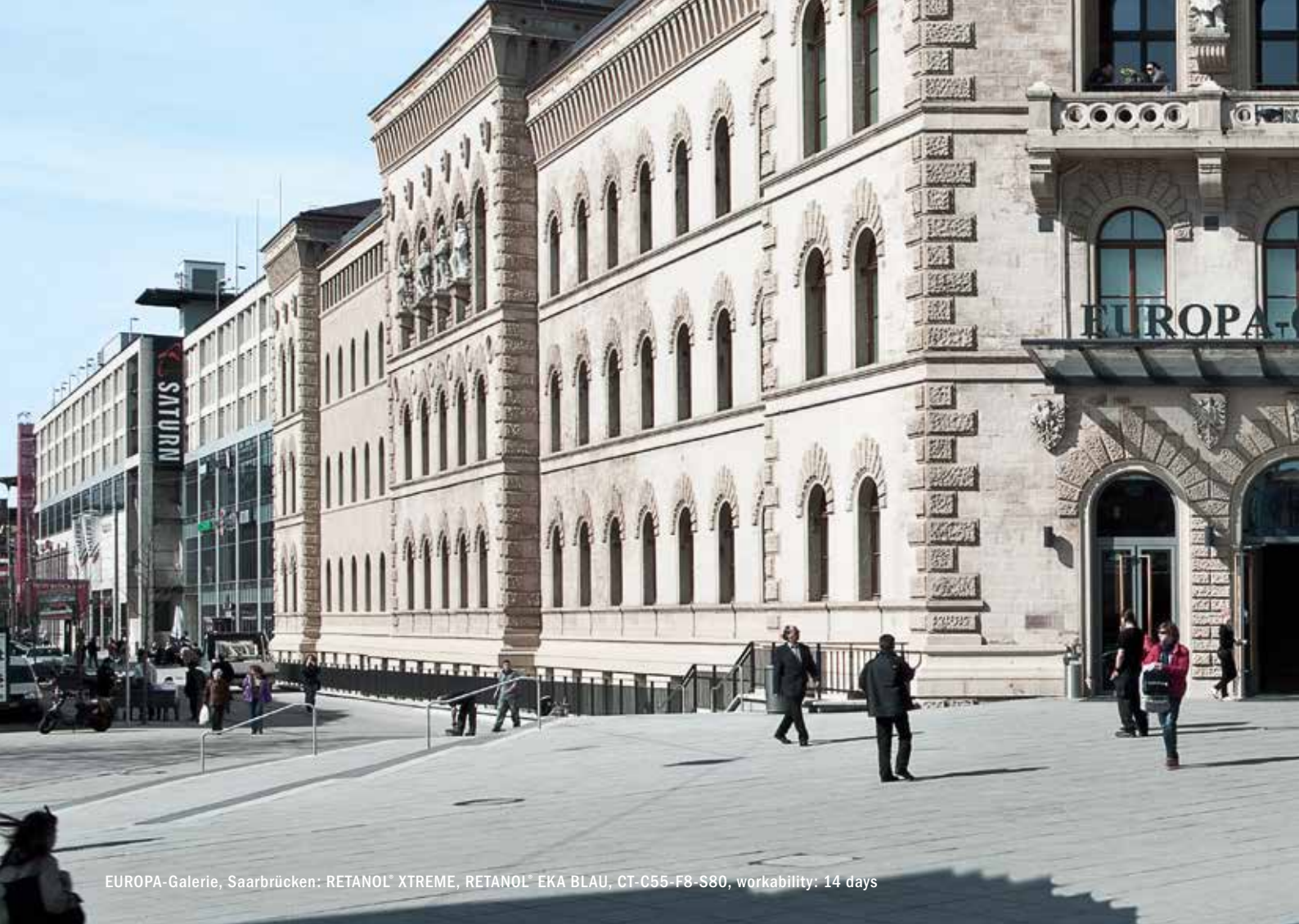
EUROPA-Galerie, Saarbrücken: RETANOL® XTREME, RETANOL® EKA BLAU, CT-C55-F8-S80, workability: 14 days